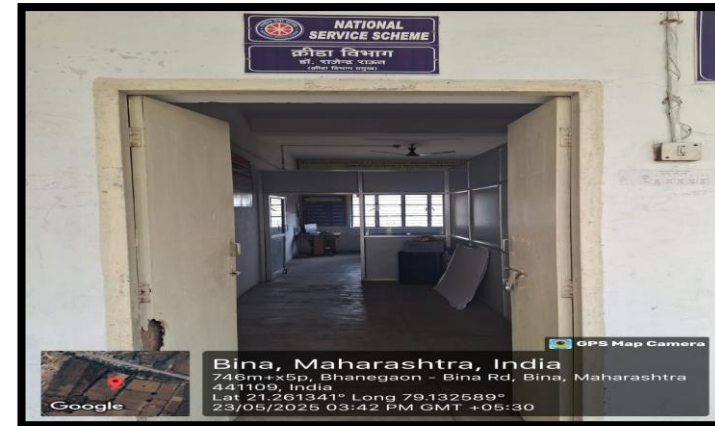
NSS and Director of Physical Education Office