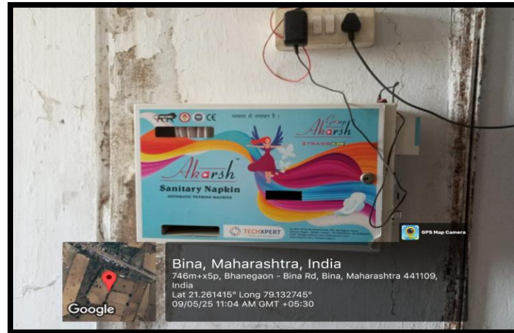
Sanatory Napkin Vending Machine