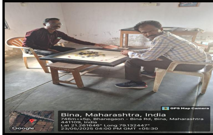
Indoor Sports Room