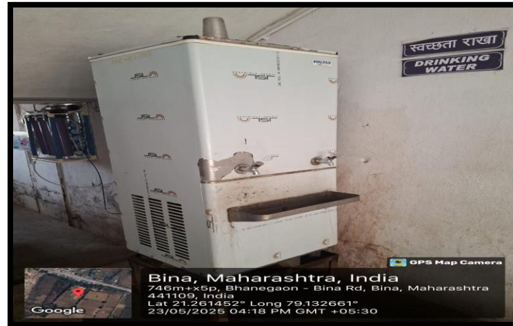
Drinking Water Facility